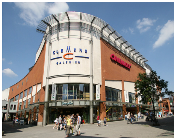
Car park “Clemens Galerien” in Solingen